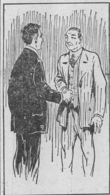
"You Have Her, and I'm Glad of It."

Meanwhile, the property room at Vinewood station has become the