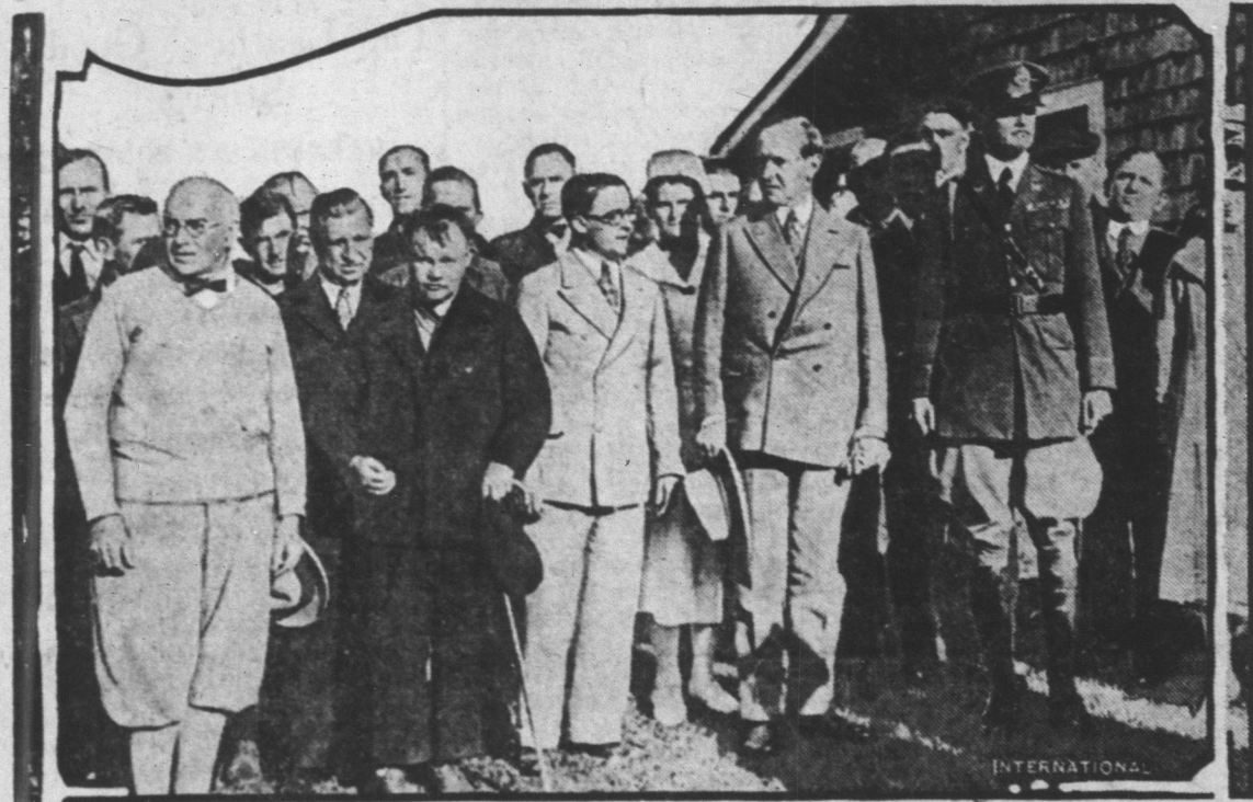
President Coolidge paid a visit the other day to the war veterans' hospital camp at Tupper Lake, N. Y. Above he is seen surrounded by patients from the hospital.