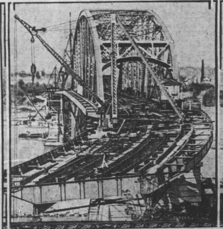
A new view of the peace bridge being built across the Niagara river, at Buffalo. It commemorates one hundred years of peace between Canada and the United States.