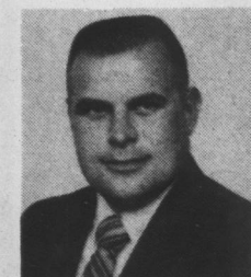
Robert Greenwood Minister