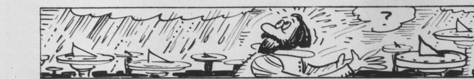
Sundials were once used to check the accuracy of clocks.

This publication also carries a list of other extension publications dealing with pruning, plants for problem areas, and disease and insect problems. These may also prove useful to the homeowner.