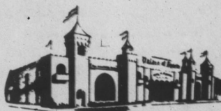
Camelot Square North Webster