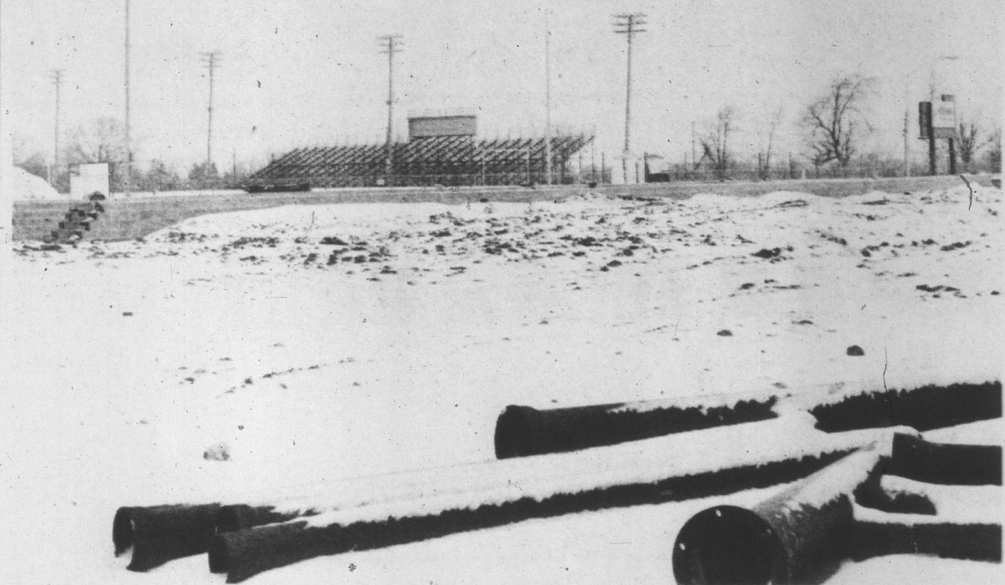
WORK HALTED — Work has halted on the physical education facility at Wawasee High School due to bad weather reports Superintendent Don Arnold. Arnold said work is now being done in the mechanics building, located on the south edge of the parking lot. Classrooms are being added to the building where school buses are repaired.