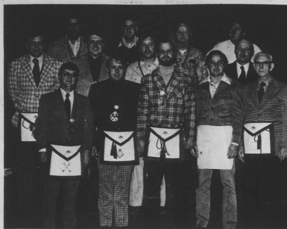
NEW MASONIC OFFICERS — Shown above are the 1978 officers of Kosciusko Lodge 418 A and FM, Milford.

The incident occurred in the early morning hours of January 1. Damage was set at $350.