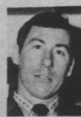
ELDON WILSON Minister