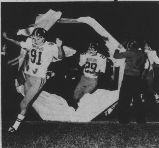
HERE COME THE WARRIORS — The Wawasee Warriors are shown above as they came onto the field last Friday night prior to the first game of the season.