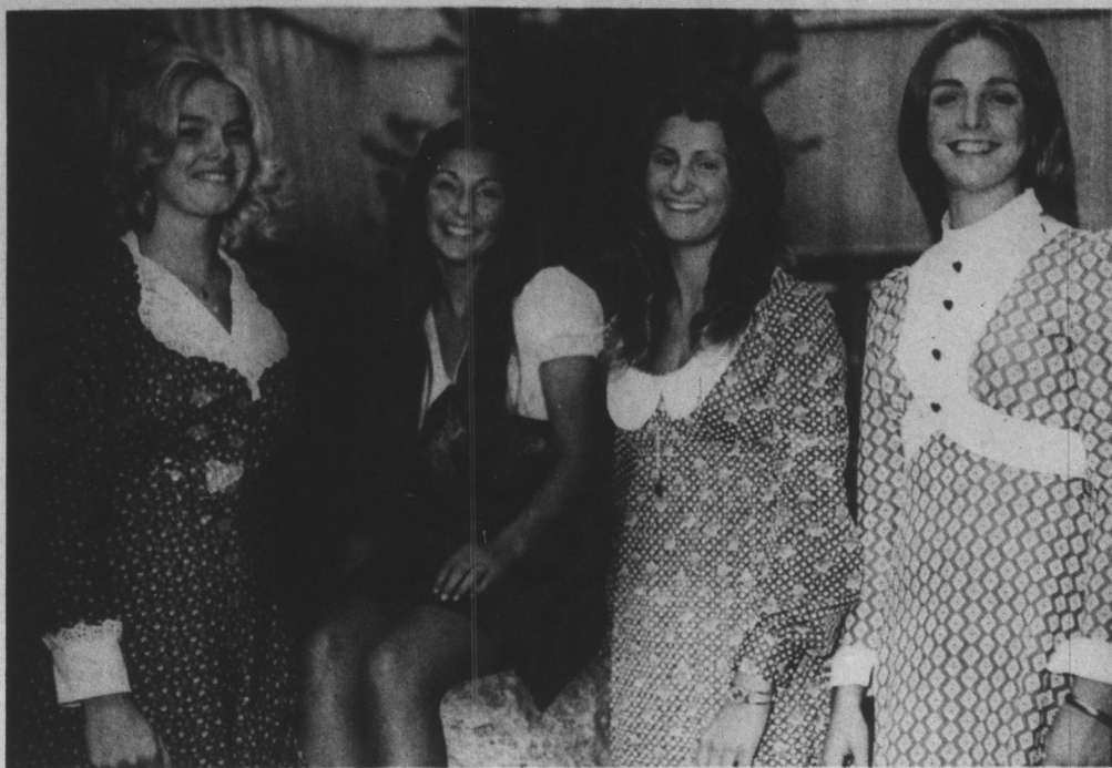
ONE WILL BE QUEEN — One of the four girls pictured above will be the 1973 Wawasee high school homecoming queen. The coronation of the new queen will take place at half-time of the Wawasee — Fairfield football game this coming Friday.