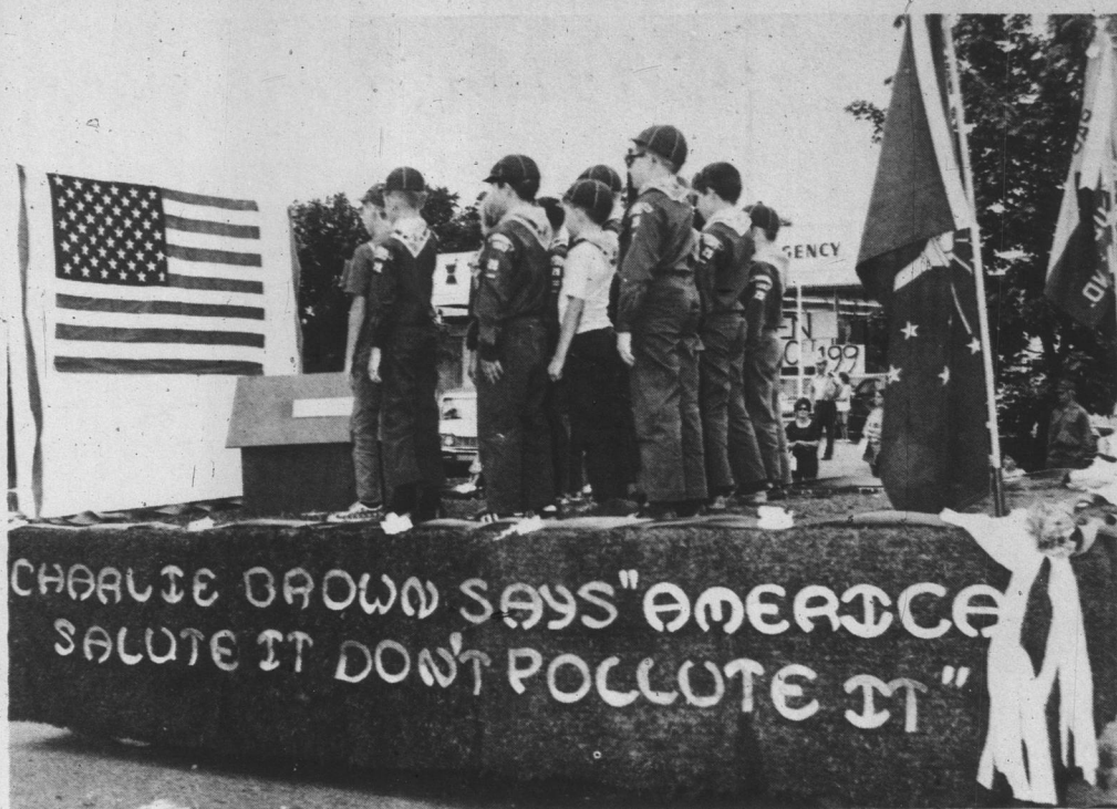
PATRIOTIC — This group of youths from Cub Pack 28 and the Webelos at Syracuse stood at attention for the U.S. flag on a float Saturday for the Police and Firemen's Fair at Syracuse bearing the words "Charlie Brown says 'America Salute It Don't Pollute It'."