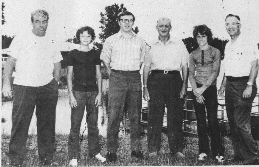
IN FISHING CONTEST — Participants and winners in the Waubee Lake fishing contest in three classes, held from May 1 to July 1, are shown here, from left —