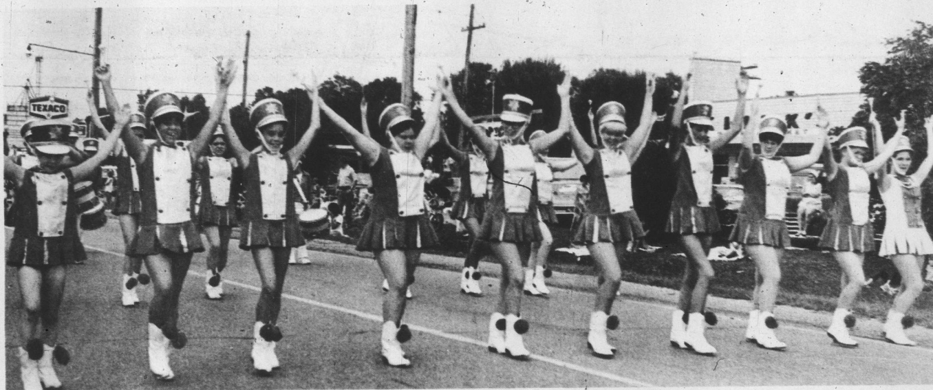
GRAND PRIZE WINNER — WABASH CORPS IN SYRACUSE PARADE

Chore-Time is the 13th Indiana plant to have received this coveted award in the 10 years it has been in existence.