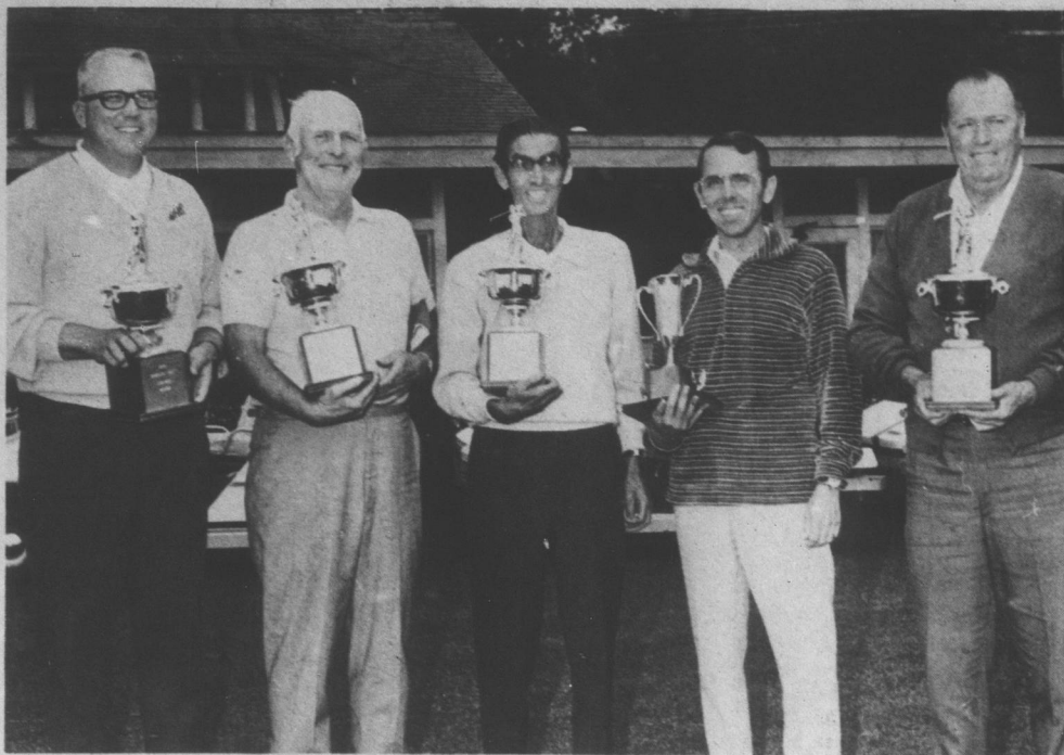
PGA SCRAMBLE WINNERS — Winners of the second annual Wawasee PGA scramble, held last Thursday at Wawasee Golf Club, are shown here:

High team game and series: Sleepy Owl — 794-2270