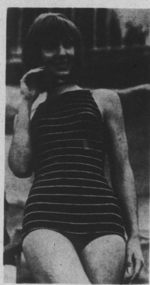
VAMP SUIT—Striped cotton knit shapes a sleeky vamp suit that's completely covered in front and boldly cut away in back.

Getting the best equipment you can afford, planning ahead to make your fishing trip as comfortable, enjoyable and productive as possible is the best way to enjoy fishing. The stores that sell fishing tackle, the many state and local tourist agencies, the many books, magazines and newspapers that cover fishing all provide help in knowing how to get the most out of fishing.