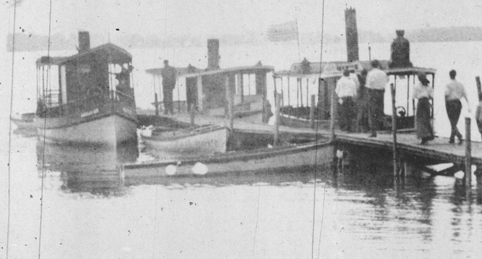
BOATING WAS BIG BUSINESS — In the early days of Lake Wawasee boating was big business as the city folk enjoyed a peaceful ride on the steamers that plied the waters of the lake. Most would go from the west or northern shores of the lake to Buttermilk point where they would turn around and head back for port. The Anna Jones was the largest of these boats. She carried 100 passengers from the Jones Hotel around the lake.