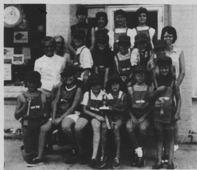
SOFTBALL TEAM — The girl's softball team sponsored by the Town Shop of Leesburg won their final game of the season. Friday, Aug. 1. They played against Kammerer's Shell Station. The five inning game turned out to be played in seven innings because of ties. Final score was 23-18. The boys' and girls' little league had hot dogs and root beer following the game Friday.