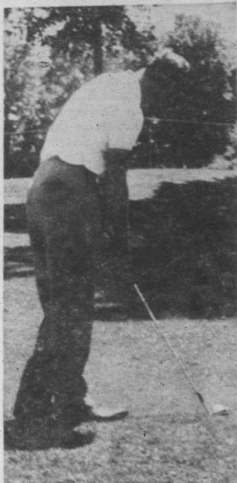
CORRECT CLUB FACE ALIGNMENT

The next time you have the opportunity to watch the top tournament players line up for a shot, be it live or on television, watch the procedure they all go through as they put the club down behind the ball and square it with the intended line of flight, then walk around the club, and square off with the line of flight, waggle the clubhead a few times, forward press, swing, and bing—everything working through the hitting area on the line of flight, resulting in another shot headed for the target.