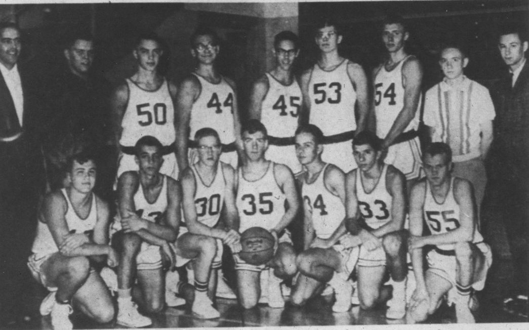
SYRACUSE YELLOWJACKETS — The fighting Syracuse Yellowjackets are ready for their first game Friday night against the Pierceton Cubs to be played on the Pierceton floor. The 'Jackets in a Monday practice session posed for this photo. Front