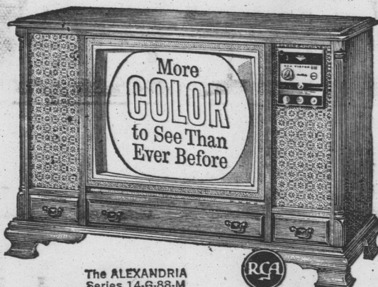
The ALEXANDRIA Series 14-G-88-M 26 1/2 sq. in. picture

Enjoy RCA Victor Mark 9 Color TV on this charming Early American all-wood lowboy. Thrill to the unsurpassed color realism of the glare-proof RCA High Fidelity Color Tube. The super-powerful "New Vista" Tuner and 24,000-volt (factory adjusted) chassis combine to bring you a picture so sharp, so true, you have to see it to believe it! Two 6"x9" Duo-Cones speakers. Come in for a demonstration!