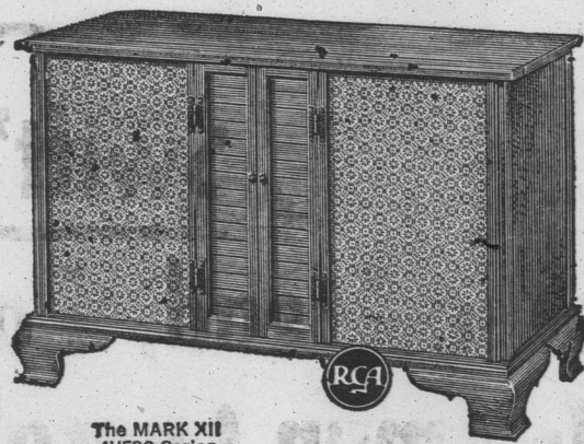
The MARK XII 4VF30 Series

Perfect companion to RCA Victor New Vista Color TV. Eight-speaker Total Sound Stereo system includes two 12" Diaphonic speakers. The Studiomatic 4-speed changer with Feather Action Tone Arm guards against audible needle scratch. Custom FM-AM-FM Stereo tuner has tuned RF stages for extra sensitivity. Dual Channel Amplifier with 24 watts maximum music power (11 watts EIA standard). See it... hear it... today!