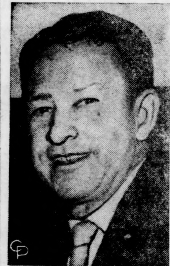
CLYDE BEATTY, 62, world famed trainer of jungle beasts, is in "poor" condition with cancer in a Ventura, Calif., hospital.