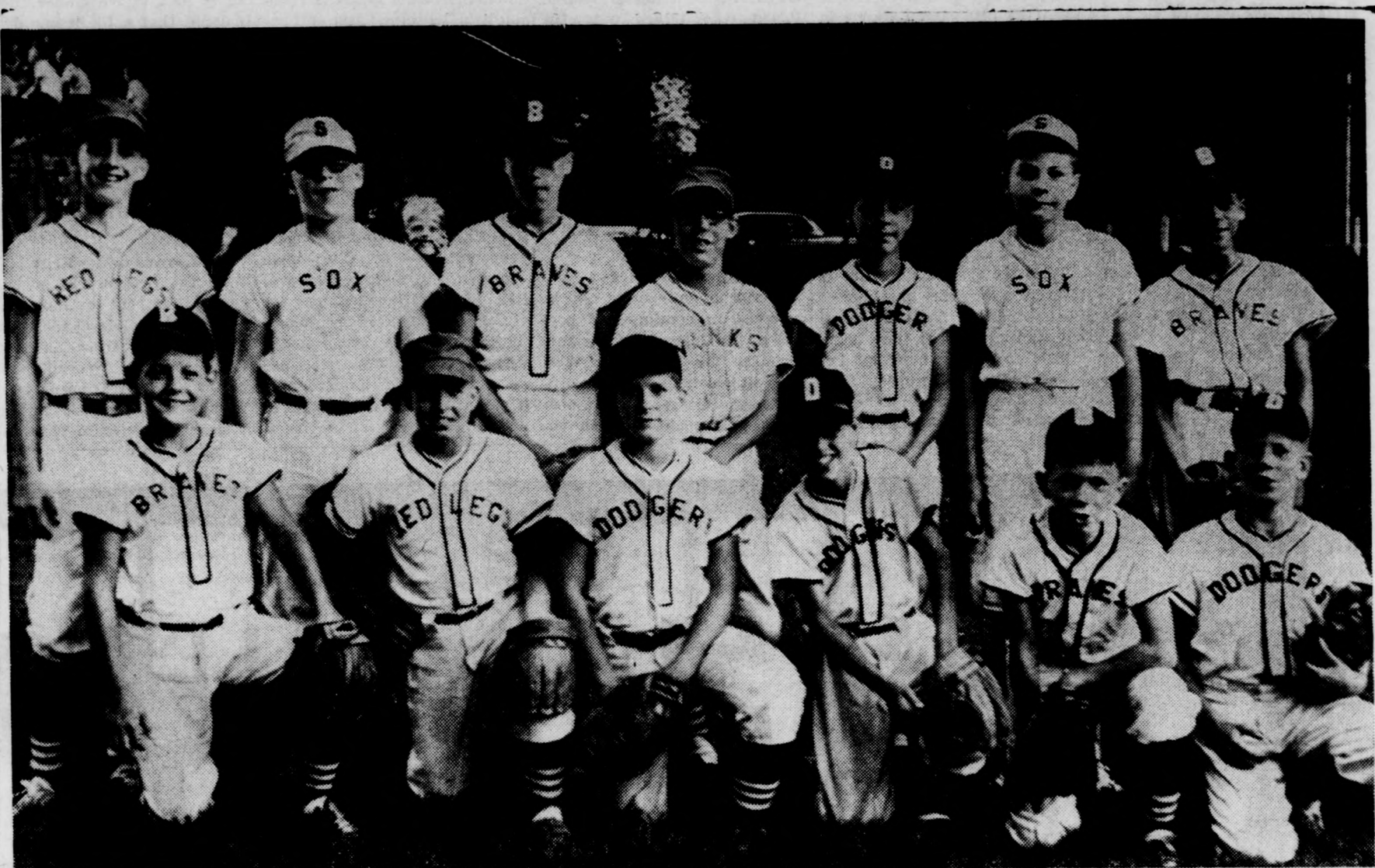
LITTLE LEAGUE TOURNEY TEAM Shown above are the Greencastle Little League All-Stars that will represent the city teams at Terre Haute July 21 when they are scheduled to tangle with West Vigo.