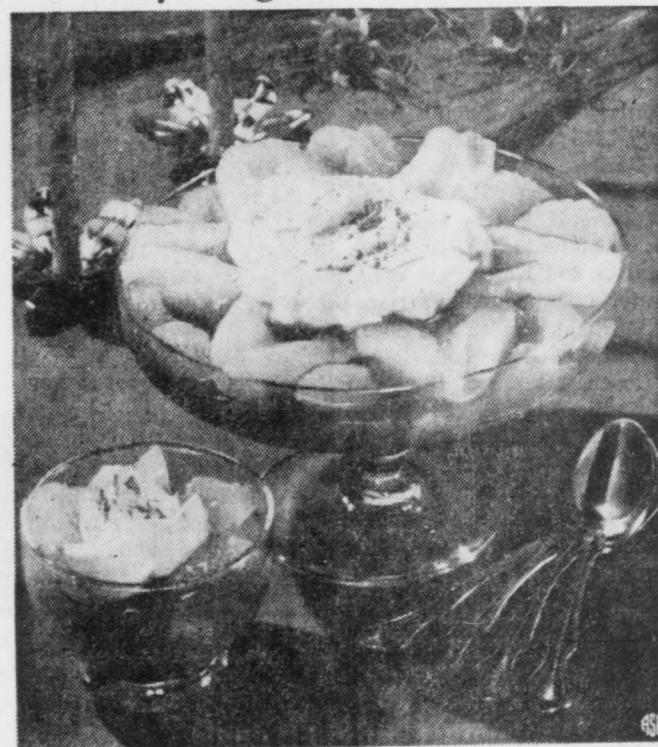
Bright in flavor, bright in color, Golden Orange-Pear Compote takes top dessert honors.

Featuring fresh fruit, always a perfect ending to a meal, this compote includes orange sections, pear halves and a subtly spiced sauce made with 7-Up, apricot jam, and lemon juice. This easy sauce cooks in moments. Try it with other fruit combinations, too—the sparkling goodness of 7-Up brings out the best in fruit flavor.