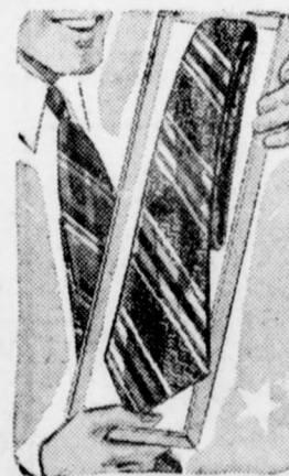
He Needs Ties

Every man wants to enjoy a complete tie wardrobe . . . they never have enough ties. He'll like these.