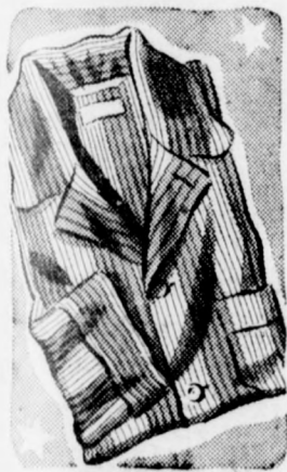
Comfy Pajamas $1.65 and up

A smartly styled silk robe for his lounging hours. Choice of striped, swiss dot and paisleys. Other Robes up to $12.00