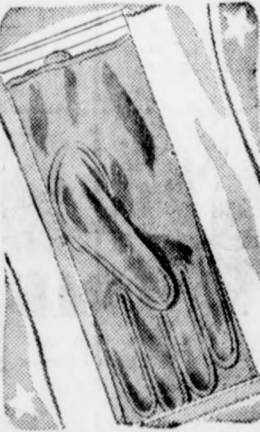
Pigskin Gloves $2.50 and up

Every man wants to enjoy a complete tie wardrobe . . . they never have enough ties. He'll like these.