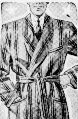
Lounging Robe $5.00 and up

Jackets of all kinds — Wool and Leather.