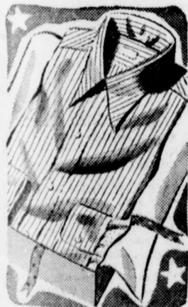
Stripes Are Right . $1.65

He'll admire your taste if you give him one of these exceptionally smart striped shirts. All sizes.