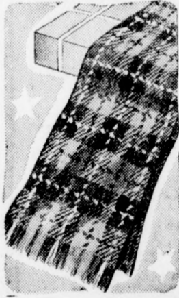
Wool Mufflers $1.00 and up

Every man wants pajamas that are comfortable, smart and suits his taste. All sizes. Also other styles and colors.