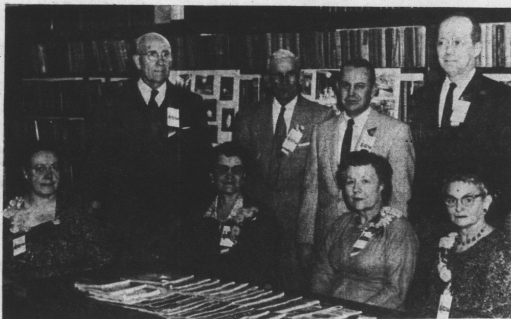
Library board members and librarians are shown here at the 50th anniversary celebration of the Syracuse Public Library Sunday 8 February. Seated left to right are Miss