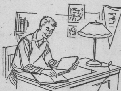
For reading . . . strong light on reading area and balanced room light