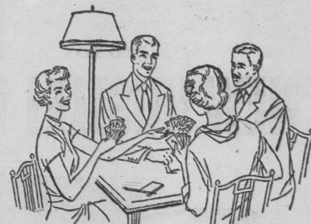
For games and the living room . . . evenly distributed light throughout the room