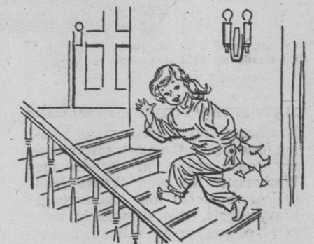
For safety . . . adequate lights at stairs, halls, porches . . . all potential danger spots