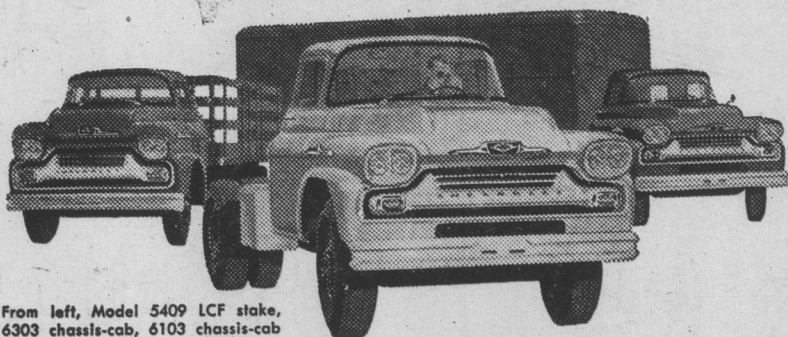
From left, Model 5409 LCF stake, 6303 chassis-cab, 6103 chassis-cab

Here for '58 in 3 hard-working weight classes! NEW HUSTLE! NEW MUSCLE! NEW STYLE!