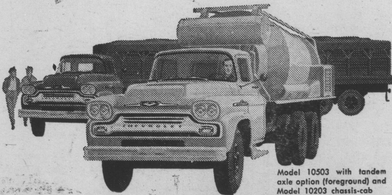
Model 10503 with tandem axle option (foreground) and Model 10203 chassis-cab

*Optional at extra cost on all Series 50 and 60 trucks except Forward-Control models