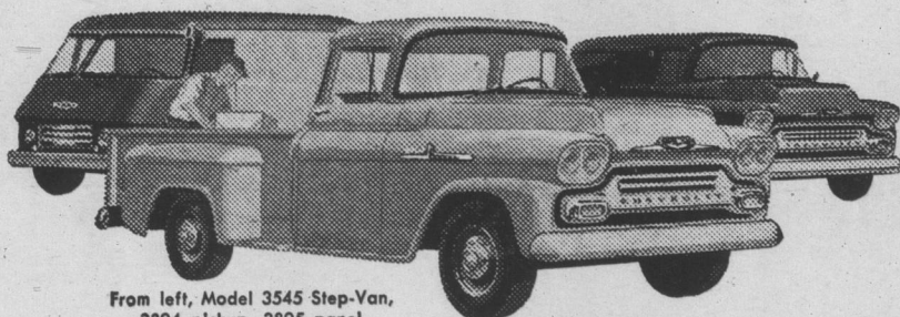
From left, Model 3545 Step-Van, 3204 pickup, 3805 panel