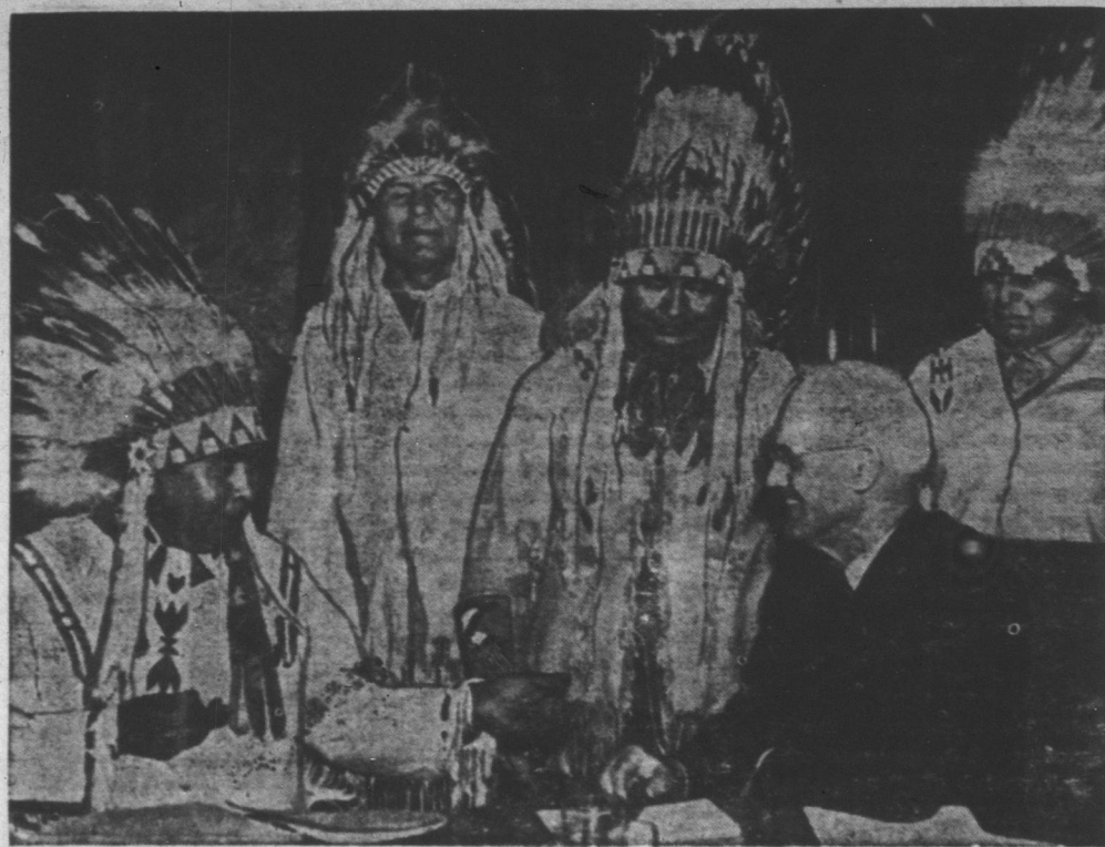
INDIANS VISIT CAPITAL . . . Sen. Arthur Watkins (R) of Utah, chairman of senate interior subcommittee on Indian affairs, confers with Yakima, Wash., Indian chiefs on disposition of inherited interests of deceased Indians.