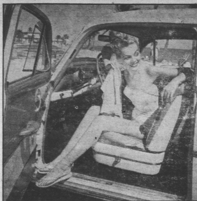
Chevrolet's new Delray Club Coupe, introduced this year, is upholstered in grain leather vinyl, an easily cleaned plastic that is waterproof. This swimmer has no fear that her sopping wet bathing suit will mark or spot the car's colorful cushions or interior trim.

BRIGHTEN UP with cheery, glowing color . . . indoors and out