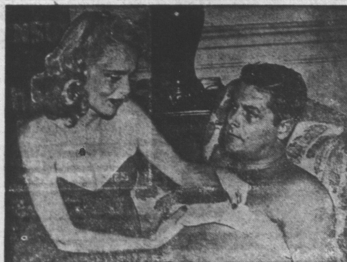
"CARVING" VICTIM . . . Actress Marie Wilson dresses the chest wound of her husband, actor Allan Nixon, in midtown hotel suite in New York City. The star's husband needed 15 stitches in St. Vincent's hospital. He received the wounds during an attack upon him by two men, one of them wielding a broken bottle—and inflicted the wounds. The fight took place in a downtown cafe in New York. The actress is a busy star of the movies and radio, her current radio vehicle being "My Friend Irma."