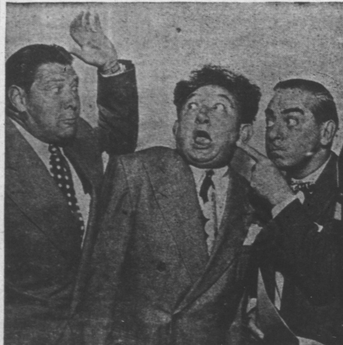
Announcer Harry Von Zell (left) and star Eddie Cantor join forces to heckle hapless comedian Bert (Russian) Gordon during a sequence of WLW-NBC's "Eddie Cantor Show," aired Fridays at 9 p.m., EST. Through long association with Cantor and Von Zell on the program, Gordon has become adept at defending himself against their gags.