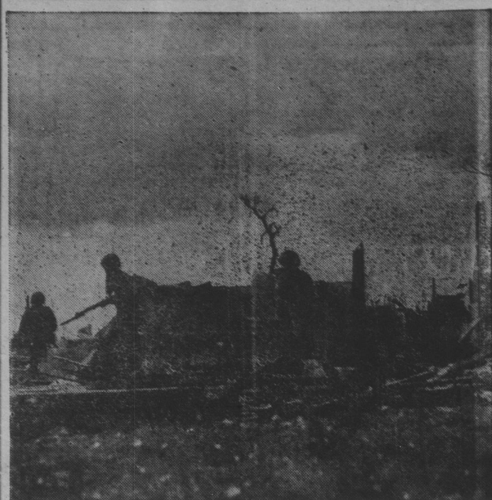
Cautiously moving ahead, their weapons ready, these Marines are shown working their way forward into Garapan, administrative heart of the Island of Saipan. Are you buying War Bonds to back them up?