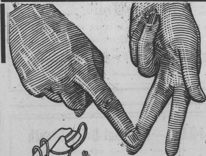
figure IT OUT YOURSELF

Count the reasons — figure it any way you wish — the answer will still be the same — you do need a telephone.