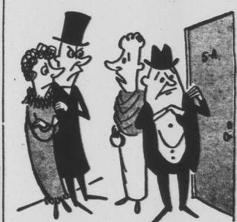
"I'M SURE YOU'LL LOVE OUR PLACE-IF ONLY YOU CAN FIND THE KEY"

CUSTOM MADE CABINETS — Formica tops; floor tile; wall tile; Mack Medsker, UL. 2-2055.