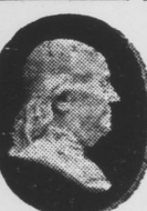
"Save and Have" CH. 4-4613