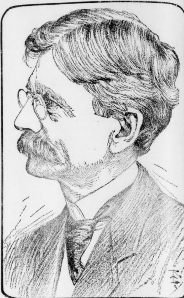
THOMAS R. MARSHALL

Wood's Liver Medicine in liquid form for malaria, chills and fever, regulates the liver, kidneys and bladder, brings quick relief to biliousness, sick-headache, constipation. Pleasant to take. The $1.00 bottle contains 2 and one-half times quantity of the 50c size. First dose brings relief. Sold by Badger & Green.