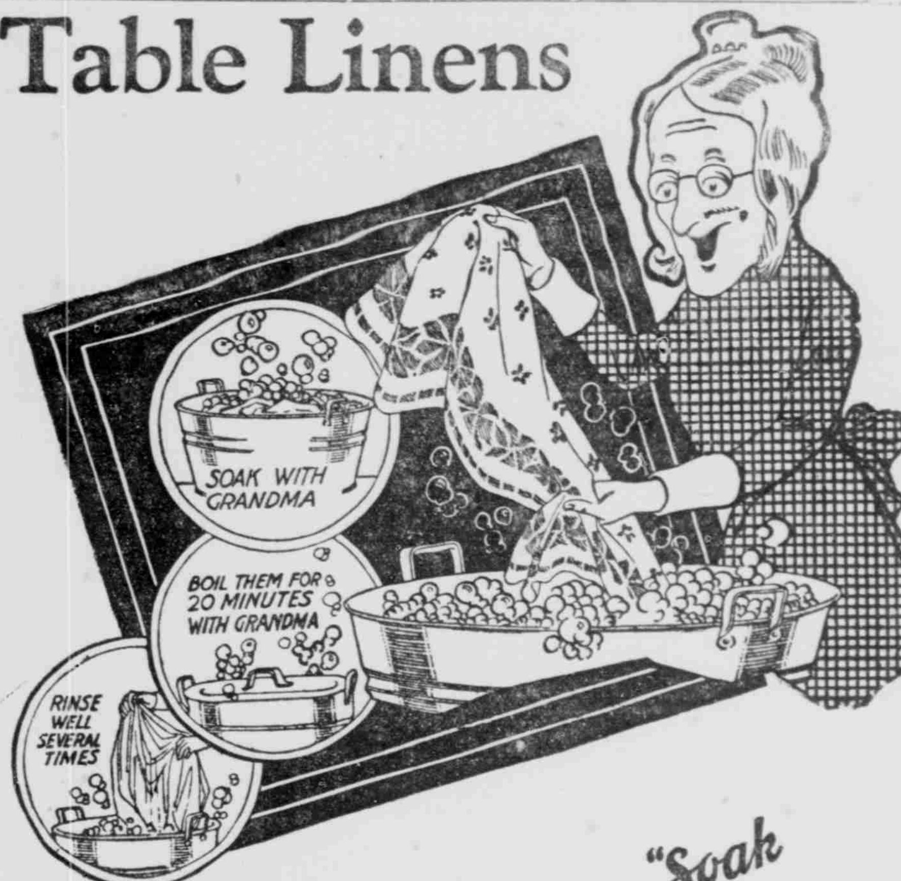
Table cloths and table linens should be more than white. They should almost sparkle in their whiteness. Soak them with Grandma. Let them remain in the water over night—or for two hours in the morning.

Then boil them for twenty minutes adding Grandma's Powdered Soap or put them through the machine for twenty minutes in hot Grandma suds.