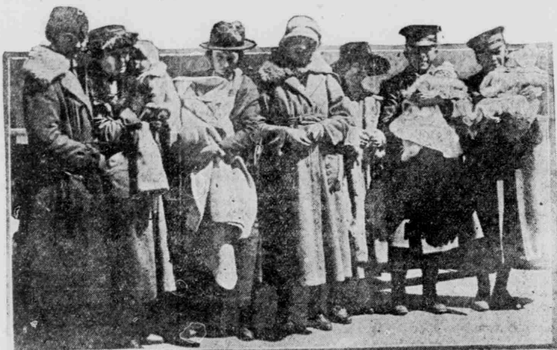
Among the new arrivals to reach America are a group of wives and babies of American soldiers who had been on duty with the army of occupation in Germany. They were entertained in Hoboken, N. J., where they landed, by Red Cross workers.