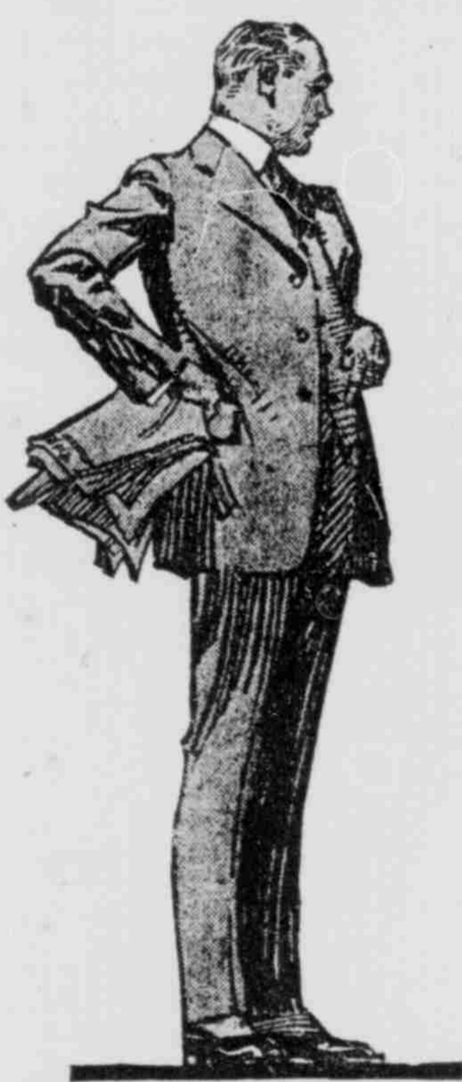
Copyright 1919, Hart Schaffner & Marx

Home of Hart Schaffner & Marx Clothes for Men and Boys