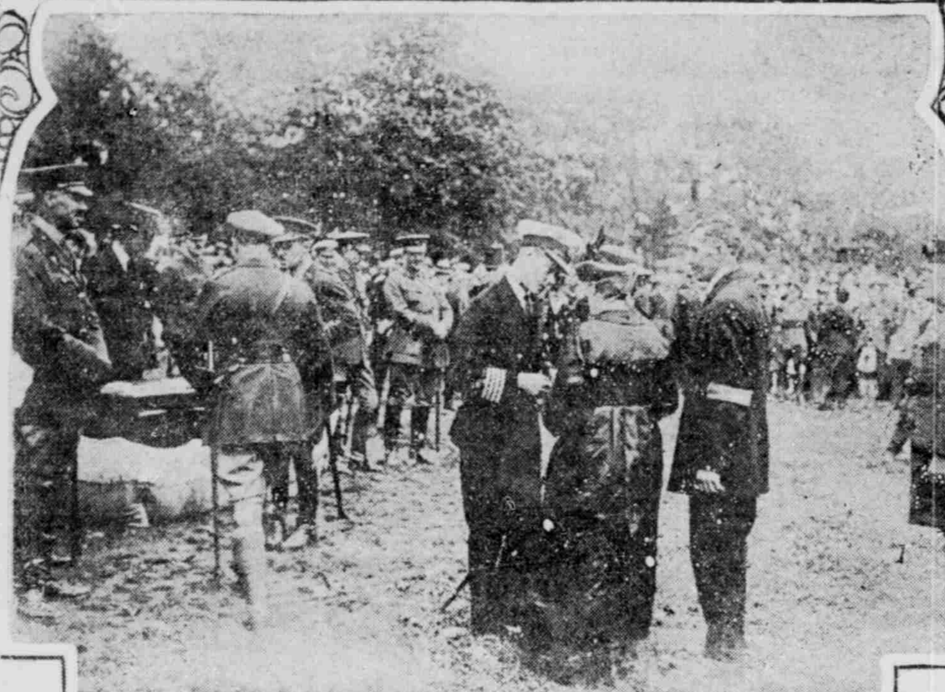
The accompanying picture shows the Prince of Wales presenting the Distinguished Service medal to a woman who lost her son at Cambrai. The proud mother was much affected during the ceremony, and, notwithstanding her severe loss, she is probably one of the proudest women in the world.