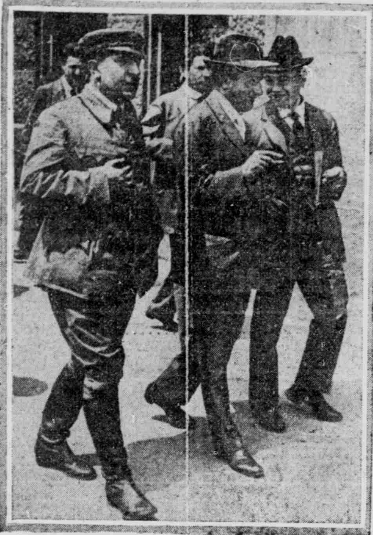
Ex-Rulers of Hungary