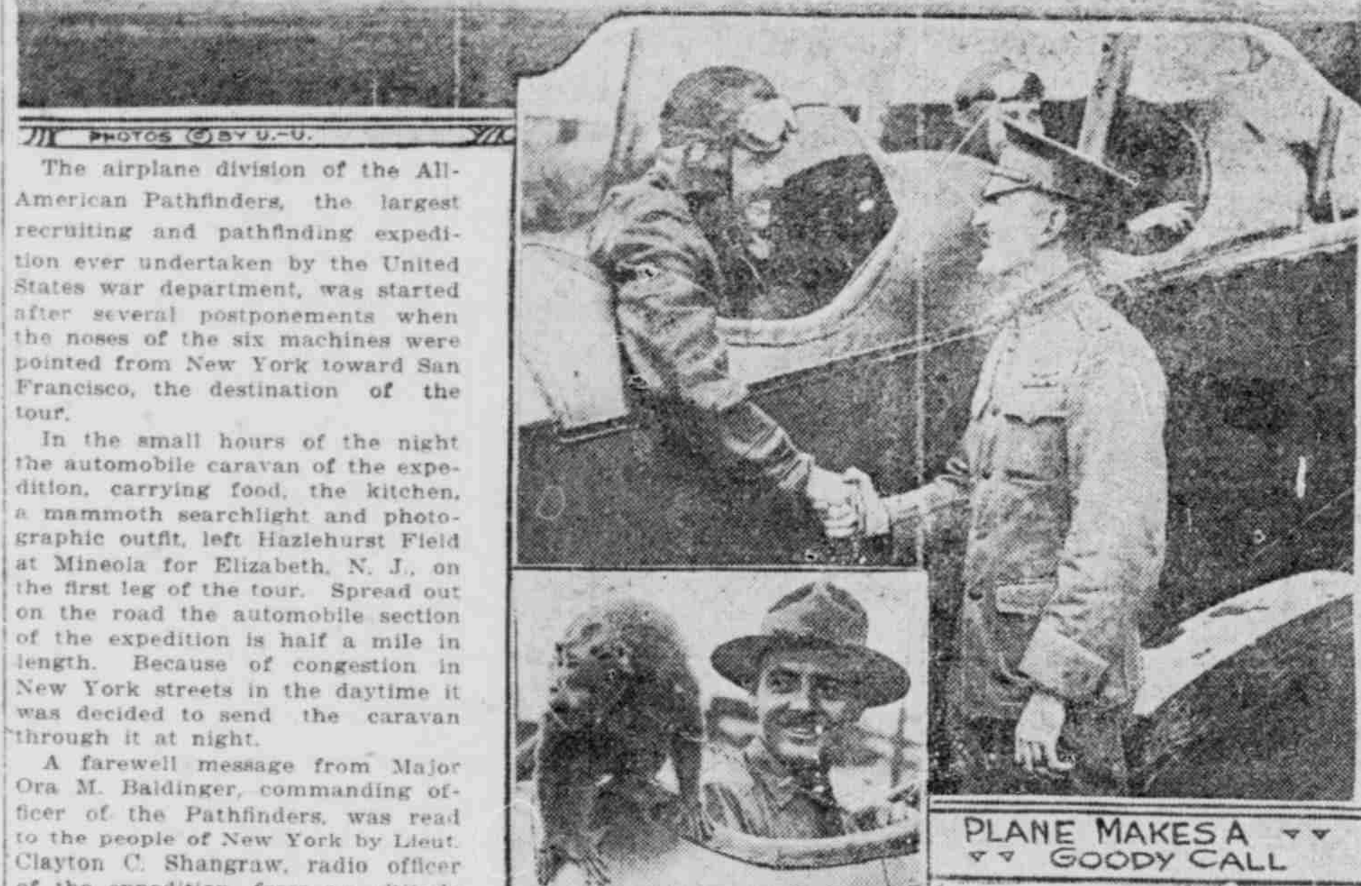
ZOOM MARY the MASCOT