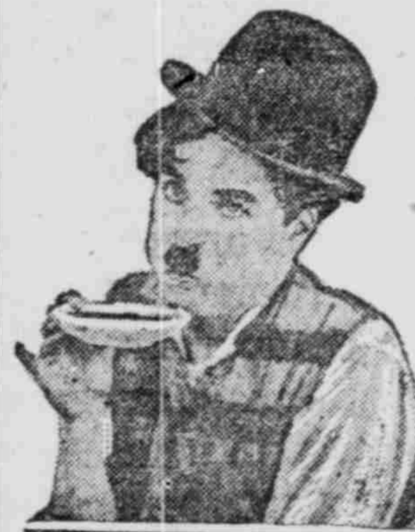
Charlie Chaplin in "Sunnyside"

TOMORROW—Dainty little PEGGY HYLAND in a bewitching six-reel comedy drama of the sea, a love story that cannot help but appeal to you. Also PATHE NEWS of current events, and an extra funny two-reel comedy, "A PAIR OF DEUCES."