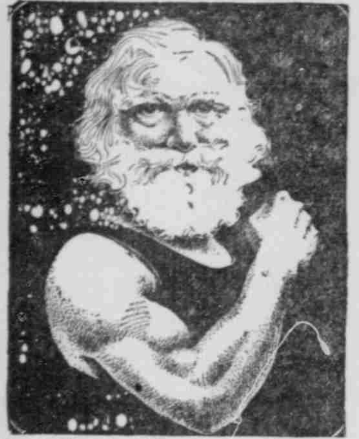
I'm the Equal in Nerve—Force and Power, to Any of the Rising Generation.

What you ARE, not what you WERE, is what counts in the game of life. It's up to men and women to be "live ones" and not slow down too soon. Kellogg's Sanitone Wafers keep your vital energy aglow—drive