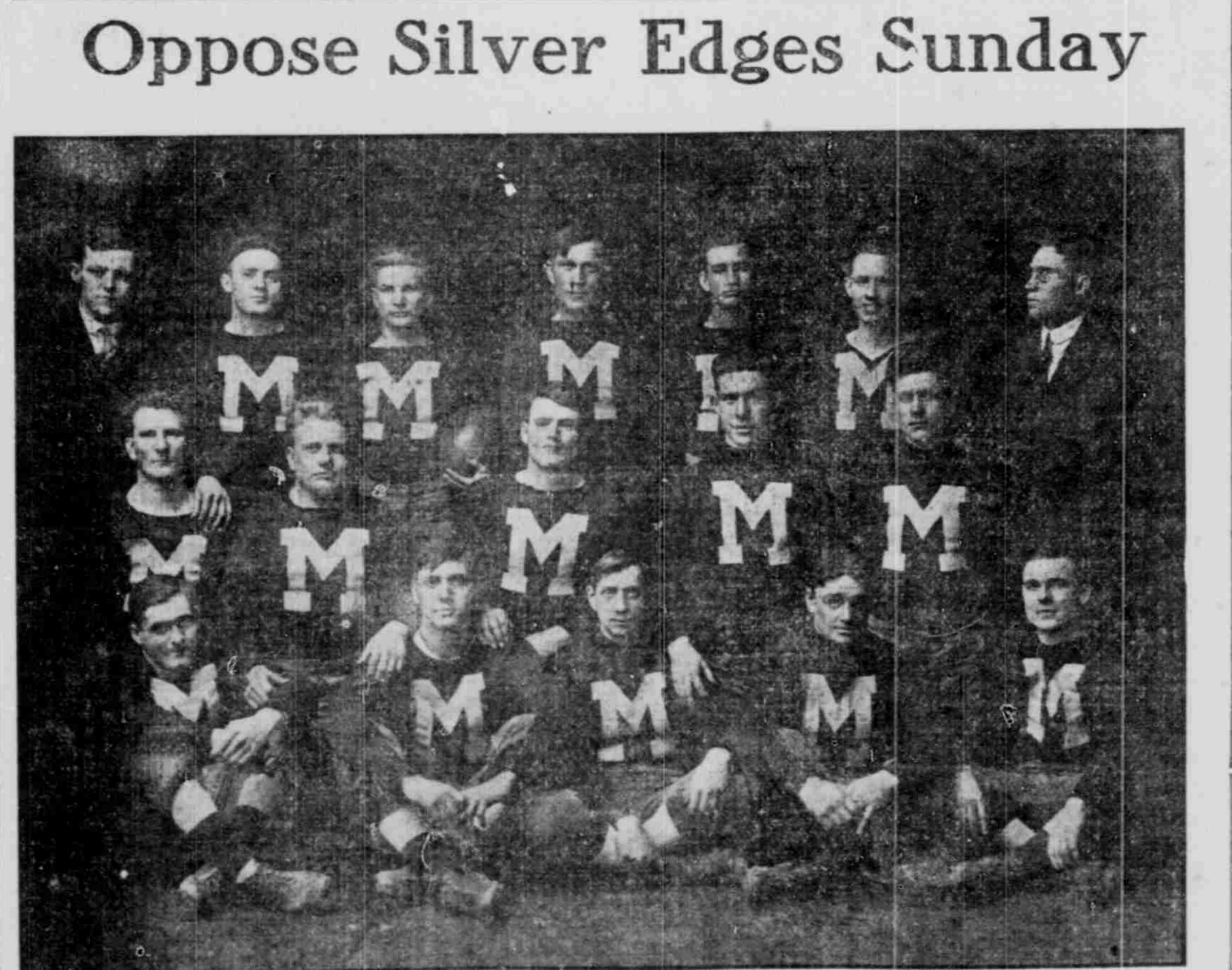
The Marion Athletic club, one of the championship elevens of the state, will clash with the local Silver Edges at Springbrook park Sunday afternoon at 3 o'clock. Their lineup includes stars on several of the 1913 Indiana teams and they promise the locals one of the stiffest games on the latter's schedule.

ADLER BROTHERS On Michigan and Washington Since 1884.