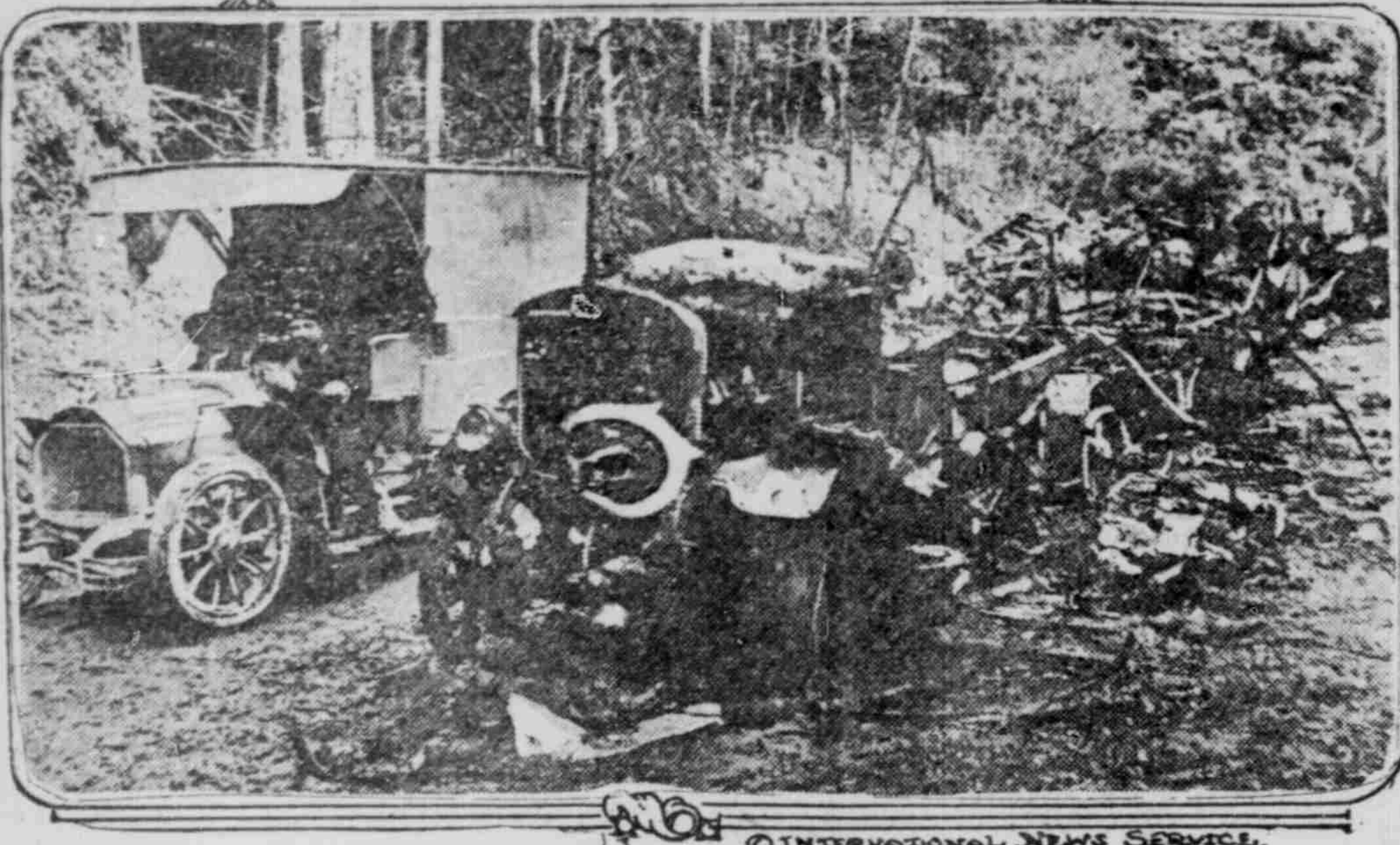
Many reports have come from the front of German supply trains ambushed and destroyed in the rush from Paris, following the battle of the Marne. This photo taken in the forest of Villers-Gotteret, shows what is left of a German motor convoy after it had been ambushed by a patrol of French dragoons.