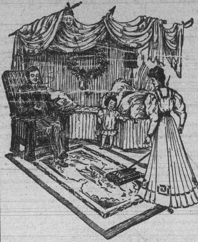
Purchases for Christmas Presents will be Marked "Sold," and Laid Away.

This is not an effort to sell old and out-of-date furniture, for it is doubtful if there was a better stock in Northern Indiana than the Williams stock, and this means rare bargains in the best furniture.