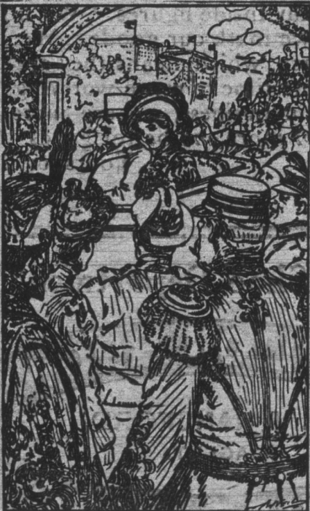
Thousands Had Been Contented with a Stare.

The science of ages, the experience of all who had gone down to the sea,