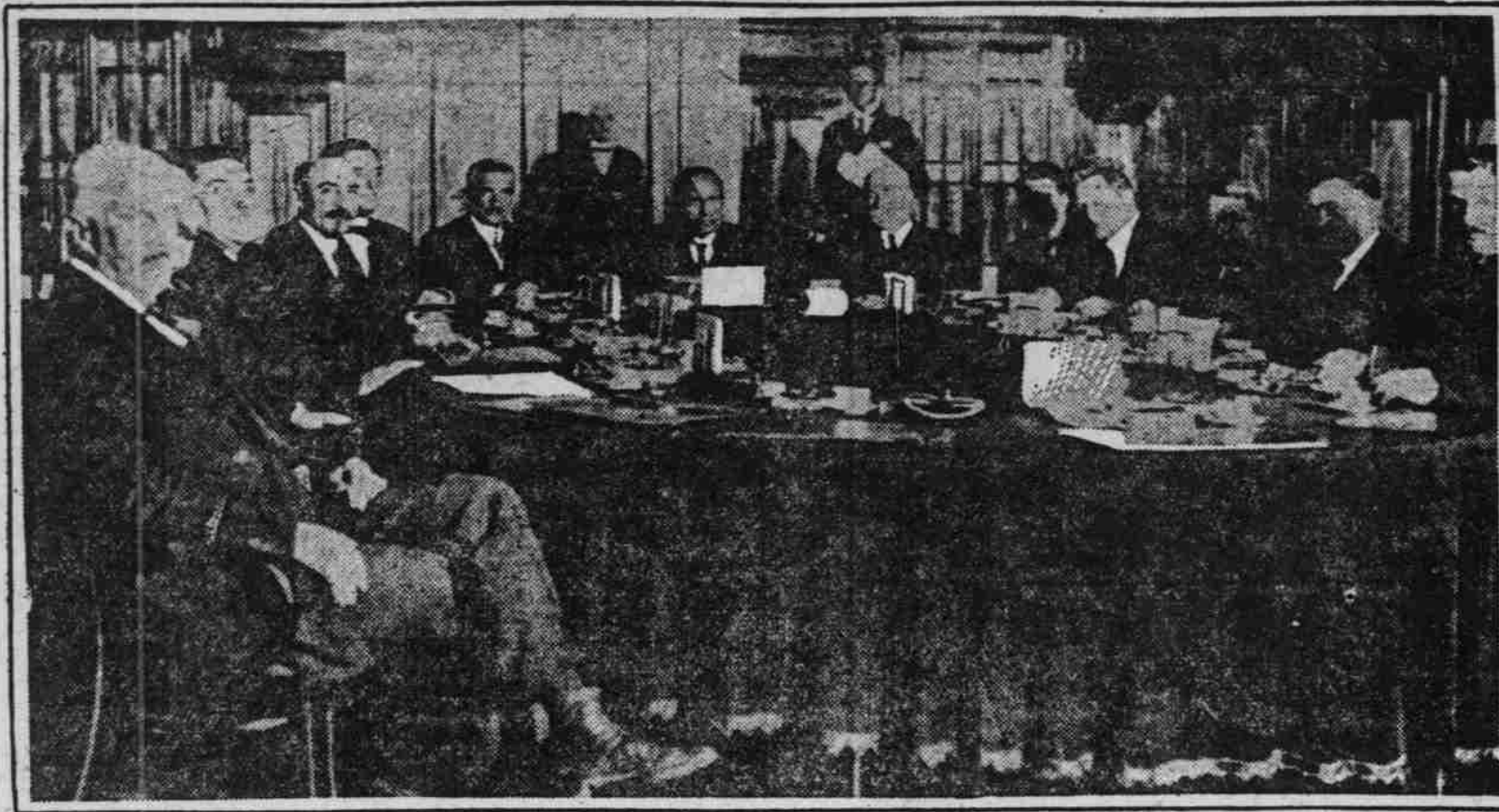
Italy's Fascist cabinet, headed by Premier Mussolini, center, General Diaz, minister of war, on his left, and Admiral Thaon di Revel, minister of marine, on right, at its first session.

Italy's new Fascist cabinet, under the direction of Premier Mussolini, now is conducting the government in Rome. Vigorous