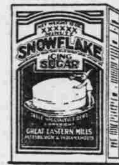
Largest Seller in Indiana Blue and Gold Package At Your Grocer's

—That's ALL the Time It Takes To Make Delicious Candies, Icings, and Sauces When You Use SNOWFLAKE 6X Icing Sugar.