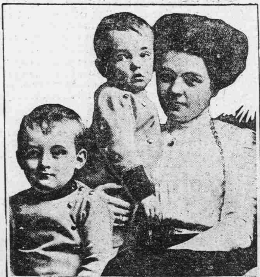
Princess Hermine of Reuss with two of her children.

Crinkled satin is one of the season's new fabrics which may be used to give a different effect to the new long dress. Since all the gowns seem to be made with long, loose side panels, a low waistline and a plain blouse, the material is the only thing which can be "different." Satin cotelet is one of many names for this new satin.