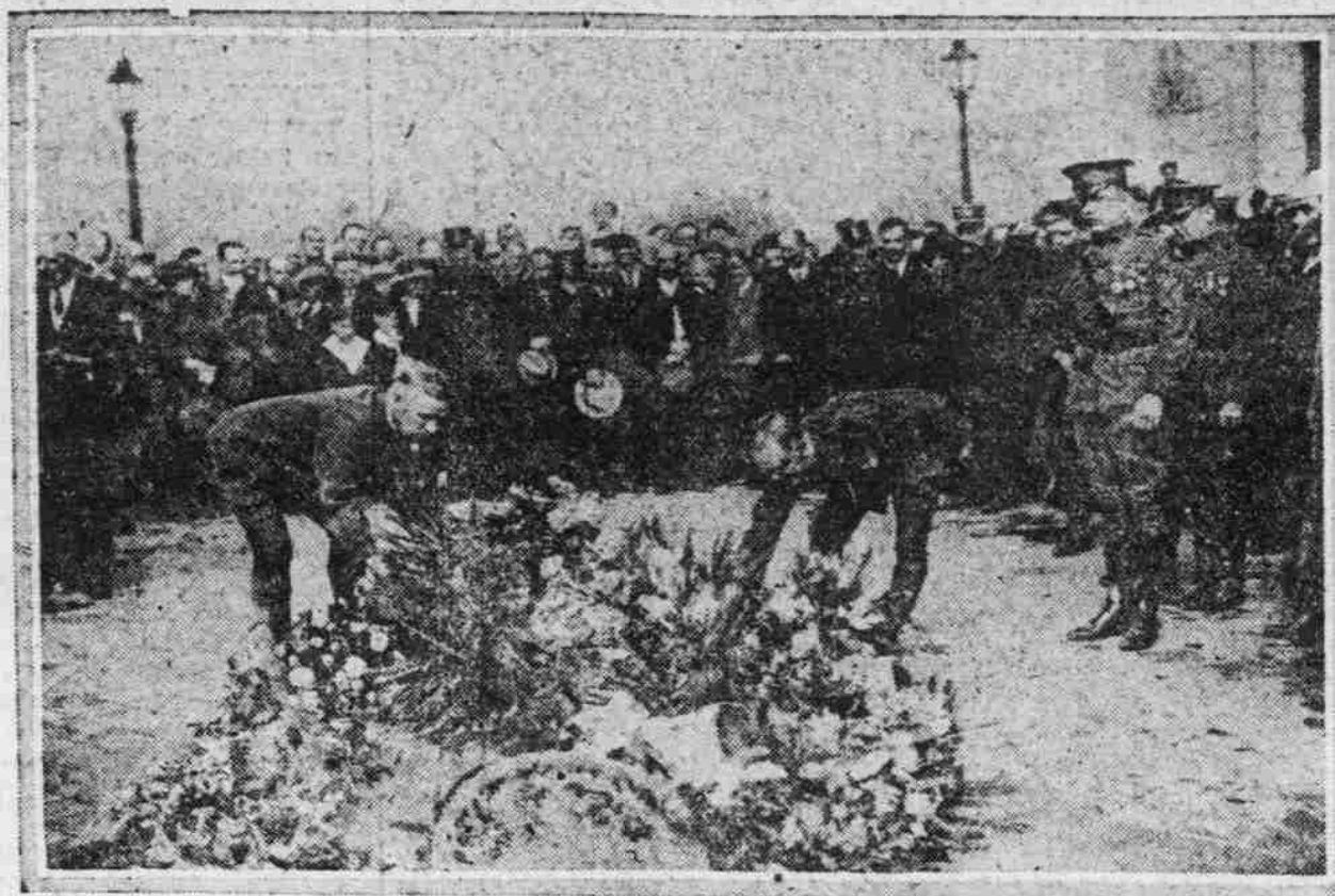
Laying a wreath on the tomb of France's unknown soldier as a tribute from the American Legion.