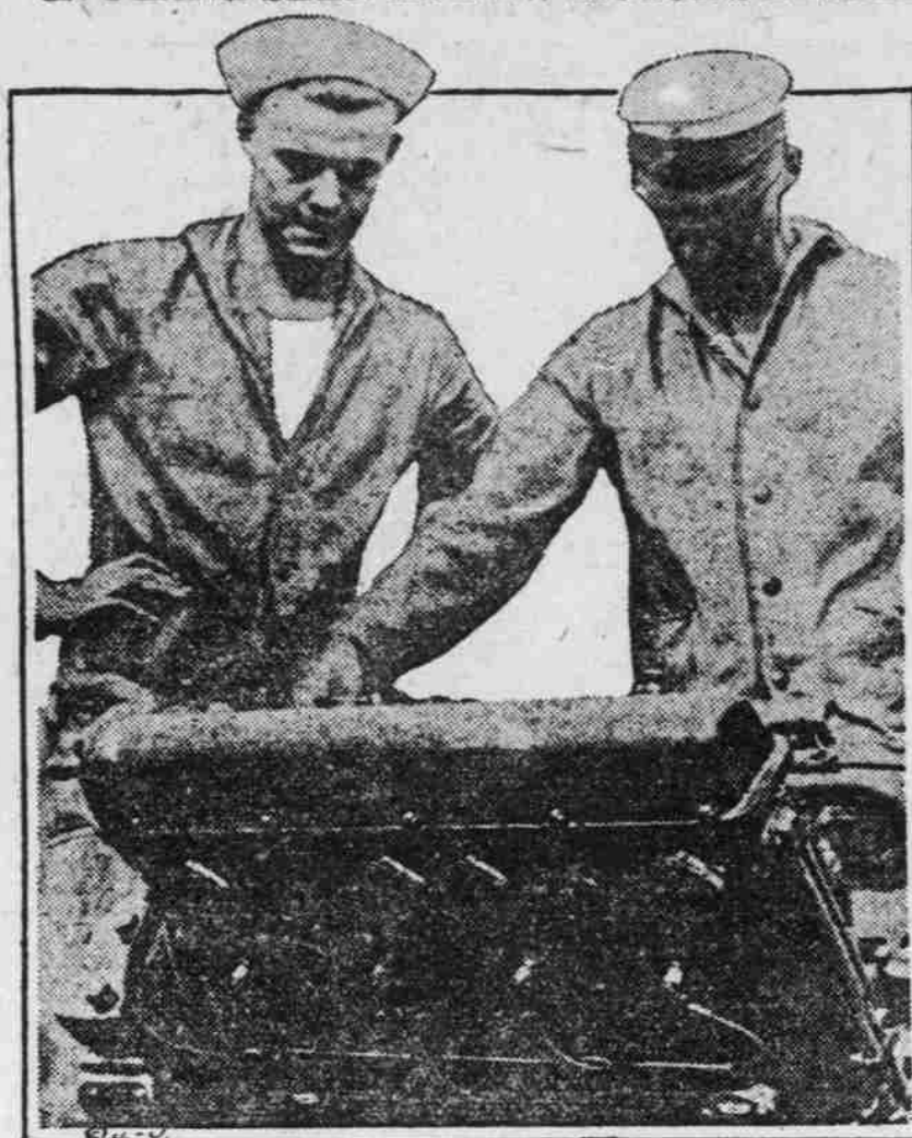
Mechanics inspecting motor after its 250-hour test.

The possibility of a non-stop flight around the world in 200 hours instead of the eighty days Jules Verne dreamed of, is seen as the result of a recent test of a new Wright airplane motor. This engine, mounted on a block, ran continuously for 250 hours. At the rate of two miles a minute an airplane driven by this motor could circle the earth in approximately 200 hours. The problem of carrying sufficient gasoline is now being tackled by experts interested in the engine.