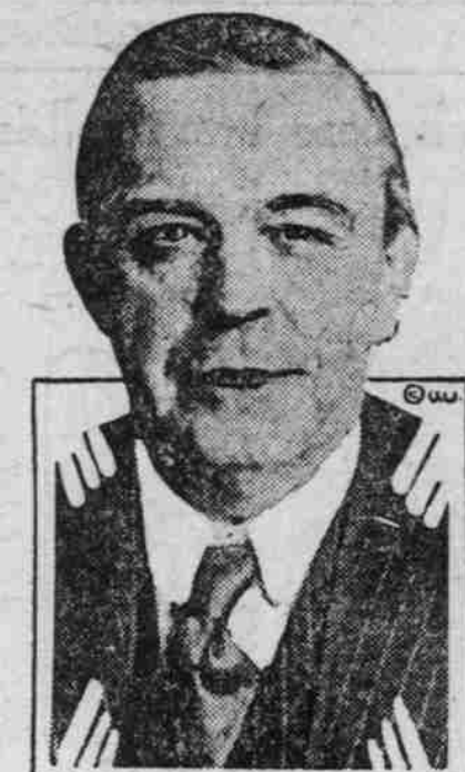
Dr. Hubert Work, postmaster general.

Postmaster General Hubert Work directs the biggest business in the United States, the postal system. The annual volume of business amounts to more than $3,000,000,000.