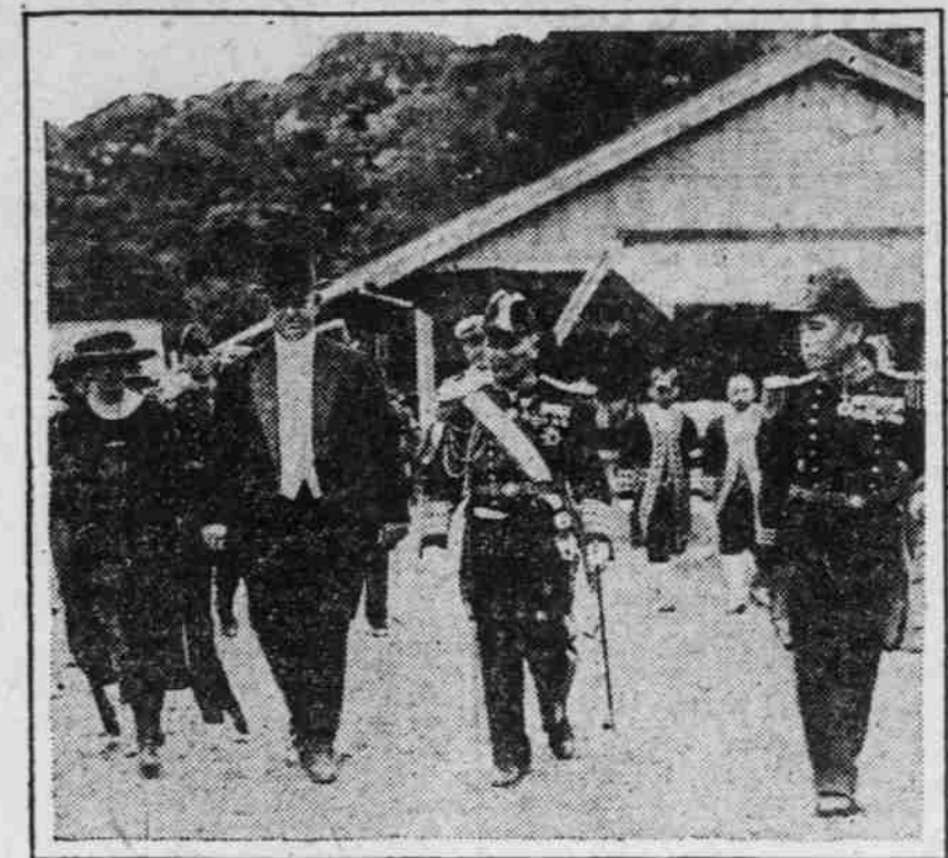
Secretary and Mrs. Edwin Denby, accompanied by Baron Ugu, at the funeral of Prince Admiral Yorihito Higashi-Fushimi.

Navy Secretary Denby and his wife attended the funeral of Prince Admiral Yorihito Higashi-Fushimi recently in Tokio. The admiral is a scion of one of the oldest families in Japan and was accorded full naval honors at the funeral.